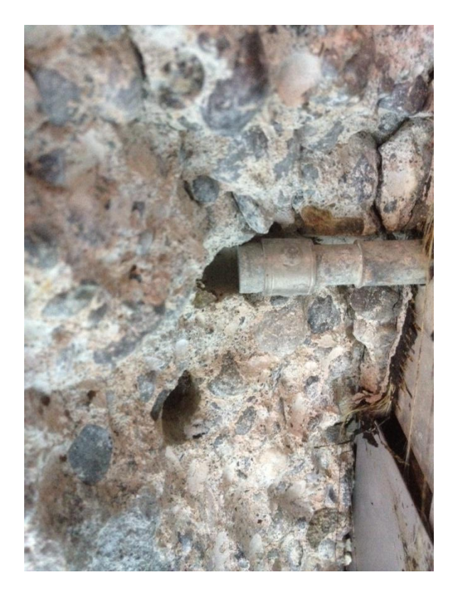
5. Exposed Window Connection Anchor Bolt