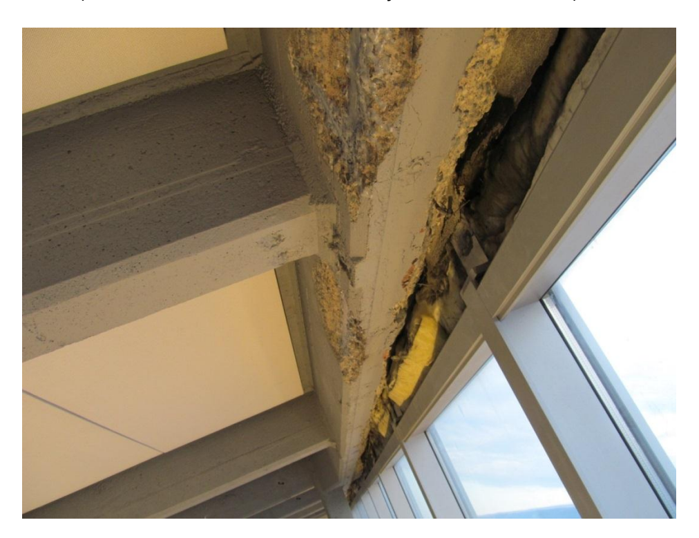
4. Close Up View