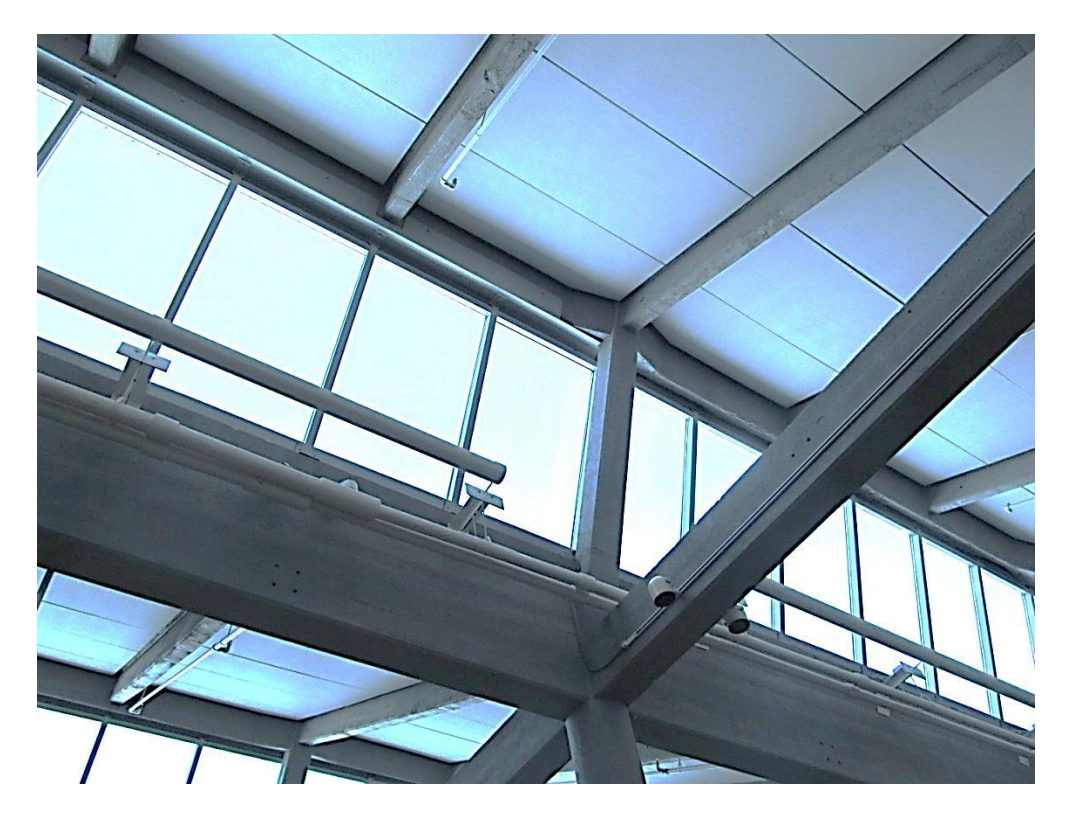
1. Atrium view of Roof Beam at top of Clerestory Window