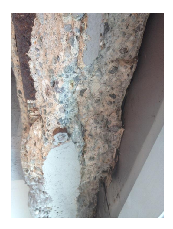
6. View of Bottom of Beam Showing Reduced Section and Exposed Reinforcement